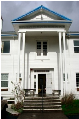
Bay City Arts Center