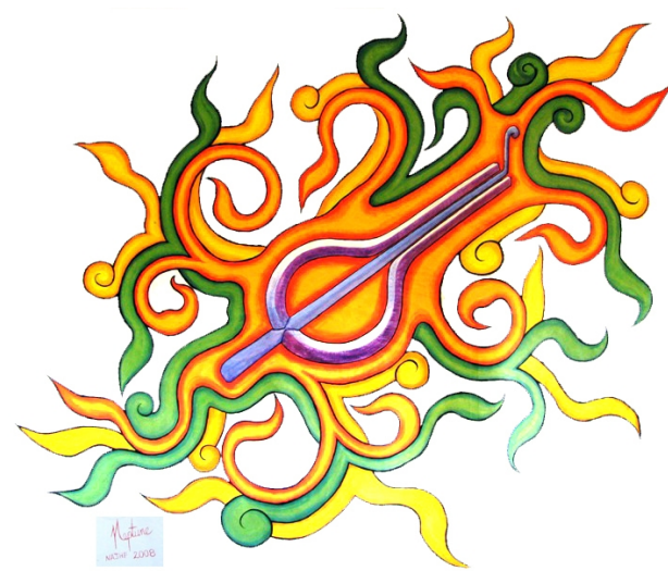
Original Painting by Neptune for NAJHF 2008 [processed for newsletter - Ed.]