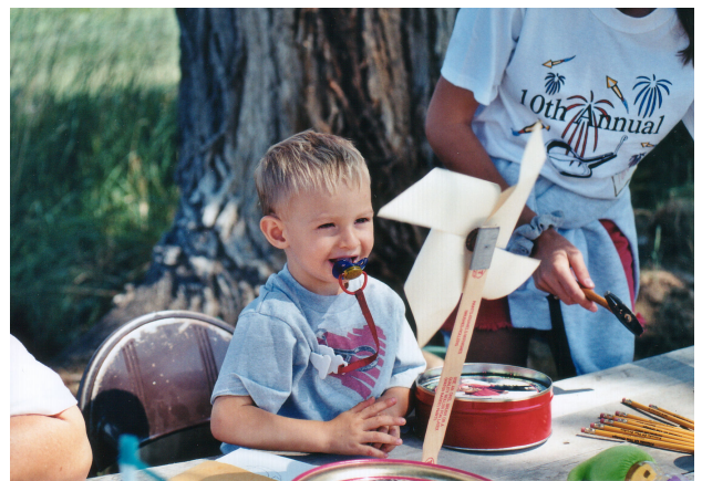
Music makes the kid in all of us happy!