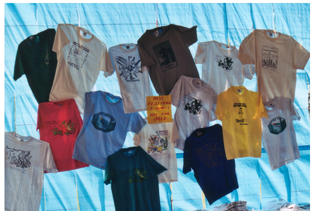
10 years of T-shirt Designs