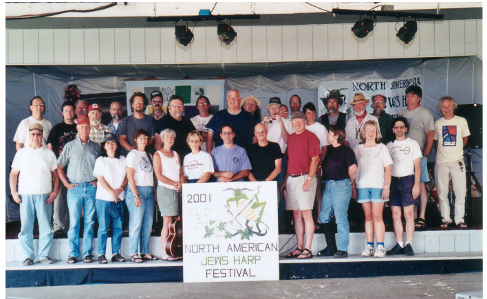
NAJHF 2001 Volunteers & Performers who made it to the photo shoot