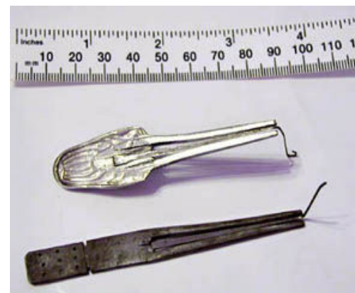
Tuvan Khomuses